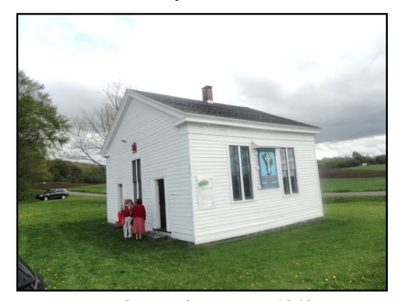
Enlli Chapel founded in 1848